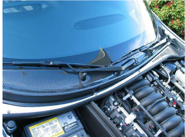
Figure 3. Loose windshield cowling can create wind noise