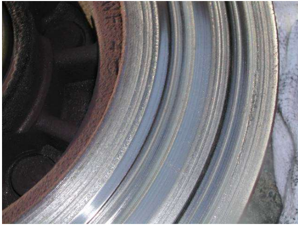
Figure 2. Extreme example of grooved brake rotors