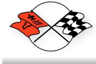
Corvette C3 Logo