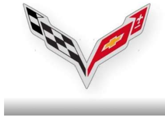
Corvette C7 Logo

The sixth-generation Corvette logo switched the shape to a V-shaped design, retaining all the elements of the fifth-gen logo, but without the circular border. The fleur-de-lis is also present, but with a slightly different design over the C5's logo.