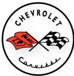
C1 Corvette Logo

While the Corvette logo has contained many of the same elements over the years, the way these elements have been presented has changed quite dramatically in the run up to the Corvette C8. Interestingly, the original Corvette logo was supposed to incorporate an American flag crossed with the black-and-white checkered flag used in motorsports. Unfortunately, restrictions on using the U.S. flag for commercial purposes prevented the red-white-and-blue from being used, so a red flag sporting a Chevrolet badge alongside a fleur-de-lis was used.