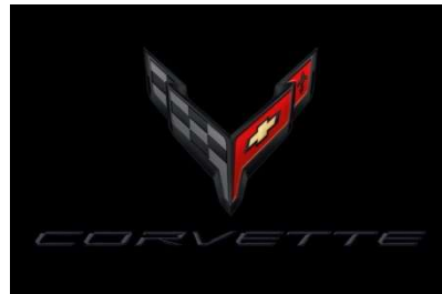
Corvette C8 Logo – Carbon Flash

Meanwhile, the 2020 Corvette C8 logo merges the two flags along the same Y-axis (vertical axis), with the Chevrolet logo and fleur-de-lis (which gets yet another revision) on the right. Like the C7 logo, the C8 logo is available in either a bright regular version or a Carbon Flash variant with blacked-out accents.