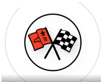
C2 Corvette Logo

The second-generation Corvette (C2) logo ditched the “Chevrolet Corvette” wording and moved the crossed flags into a more upright position.