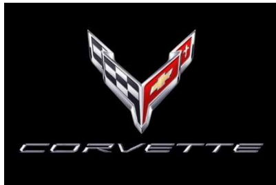
Corvette C8 Logo – bright regular

For the seventh-generation Corvette, the logo became much more angular, with the crossed flags unfurled at a 60-degree angle and the edges sharpened to points. The Chevrolet logo was angled and features a white/silver border around it, while the fleur-de-lis gets another modification to its design.