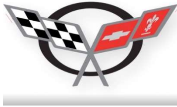
Corvette C5 Logo