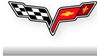
Corvette C6 Logo

The fifth-generation Corvette logo was a return to form, with the two flags making a comeback. They are, once again, crossed at a sharp angle. The fleur-de-lis, meanwhile, returns near the Chevrolet logo, albeit in a slightly different representation.